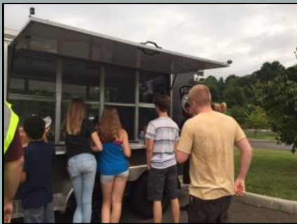
The 4th of July Event held at the Vinton War Memorial