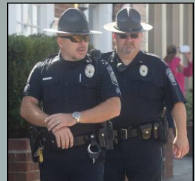
VA State Police Event Longwood Manor Apartments and Glade Town Reunion