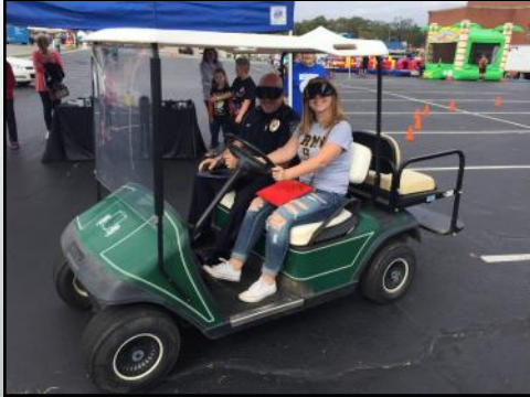
The Vinton Fall Festival. Showing off the new Mobile Community Services Unit and accessories.