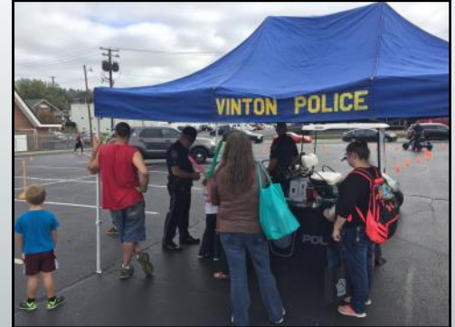
Downtown Trick or Treat. We set up our Mobile Community Services Unit to hand out lots and lots of candy.